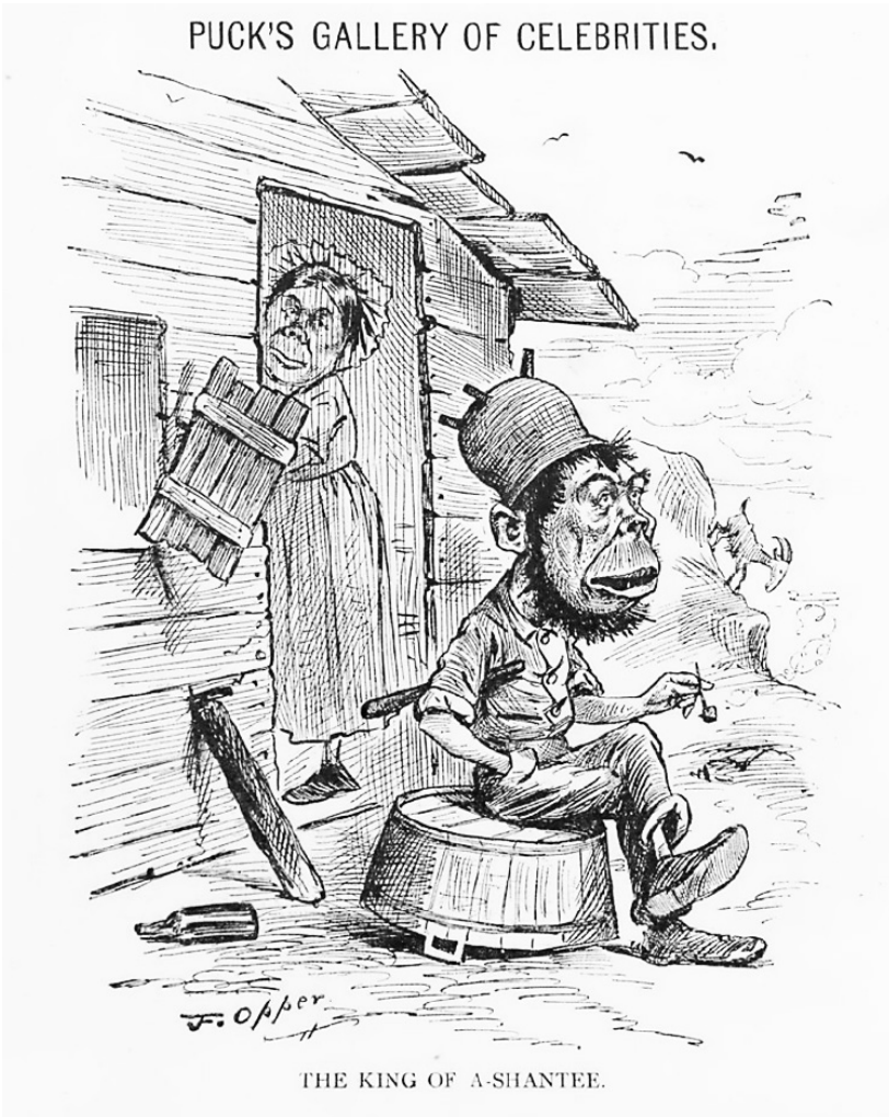
Source: Opper, Frederick Burr. "Puck's Gallery of Celebrities. The King of A-Shantee." Cartoon, February 15, 1882, Library of Congress. http://www.loc.gov/pictures/item/97512306/ .