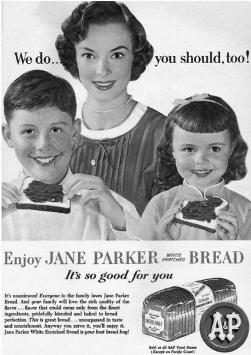
A&P Jane Parker Bread. Magazine advertisement. 1956.